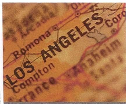
Integrating Technology for Cost and Time Savings